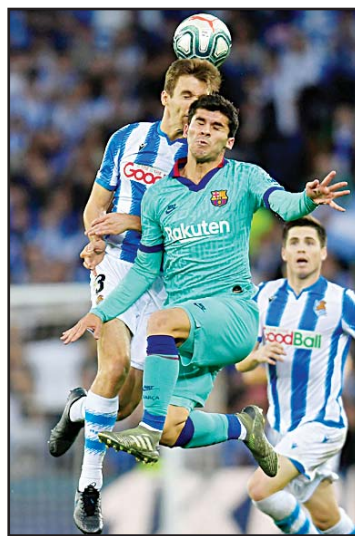
Barcelona's Carles Alena jumps for the ball with Real Sociedad's Diego Llorente, (left), during the Spanish La Liga soccer match between Real Sociedad and Barcelona, at Anoeta Stadium, in San Sebastian, Spain, Dec. 14.

tle challengers after a run of eight straight wins since a loss at Anfield in October. But this draw means the