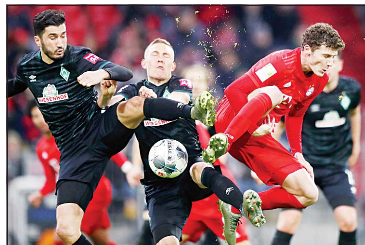
Bremen's Nuri Sahin (left), and Bayern's Benjamin Pavard (right), challenge for the ball during the German Bundesliga soccer match between FC Bayern Munich and SV Werder Bremen in Munich, Germany, on Dec 14.

back from successive 2-1 defeats to Borussia Mönchengladbach and Bayer Leverkusen.