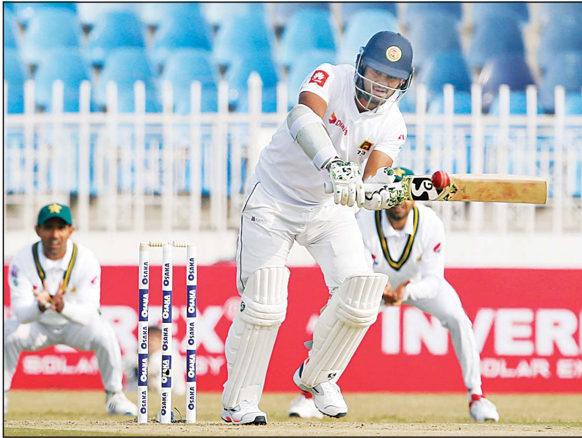
Sri Lankan batsman Dimuth Karunaratne plays a shot during the first day of the 1st cricket Test match between Pakistan and Sri Lanka in Rawalpindi, Pakistan on Dec 11.