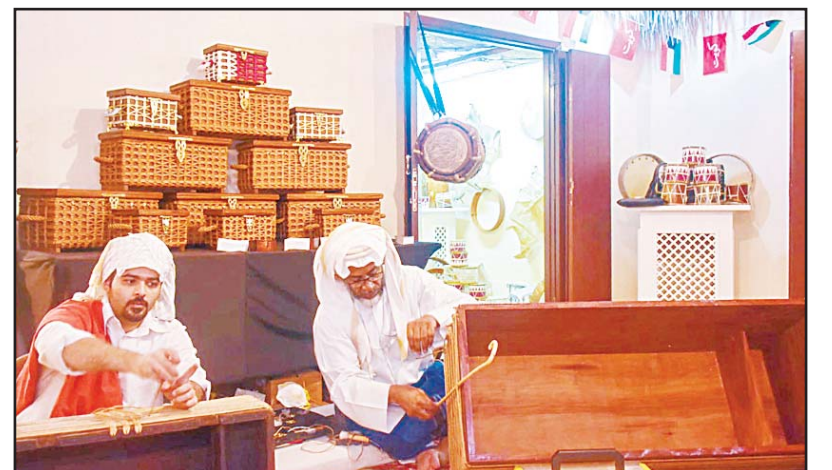
KUNA photos Kuwaiti craftsmen in the Katara 9th Traditional Dhow Festival.

The committee discovered that 43 percent of the items included in the budget were subjected to shifting, which implies that the estimated budget was not specified based on accurate studies. It stressed the need to activate the Audit and Inspection Office in order to avoid the repetition of such violations, and also insisted on the need to fill the vacancies especially the supervisory positions.