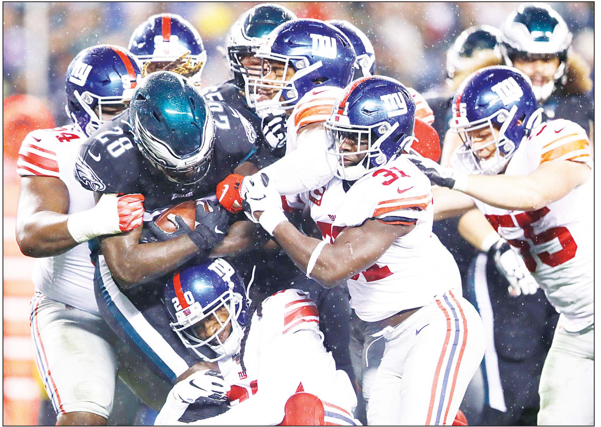
Philadelphia Eagles' Jay Ajayi (28) is tackled by New York Giants' Dalvin Tomlinson (94), Janoris Jenkins (20), Corey Ballentine (25) and Michael Thomas (31) during the first half of an NFL football game against the New York Giants on Dec 9 in Philadelphia.

waning seconds of the third quarter. Hit by Devin McCourty, the Chiefs tight end fumbles the football and Stephon Gilmore recovers with plenty of room to run toward the end zone. The play is blown dead, however, and Kelce ruled down by contact. Belichick uses his final challenge and the call is overturned. New England get the ball at their 43.