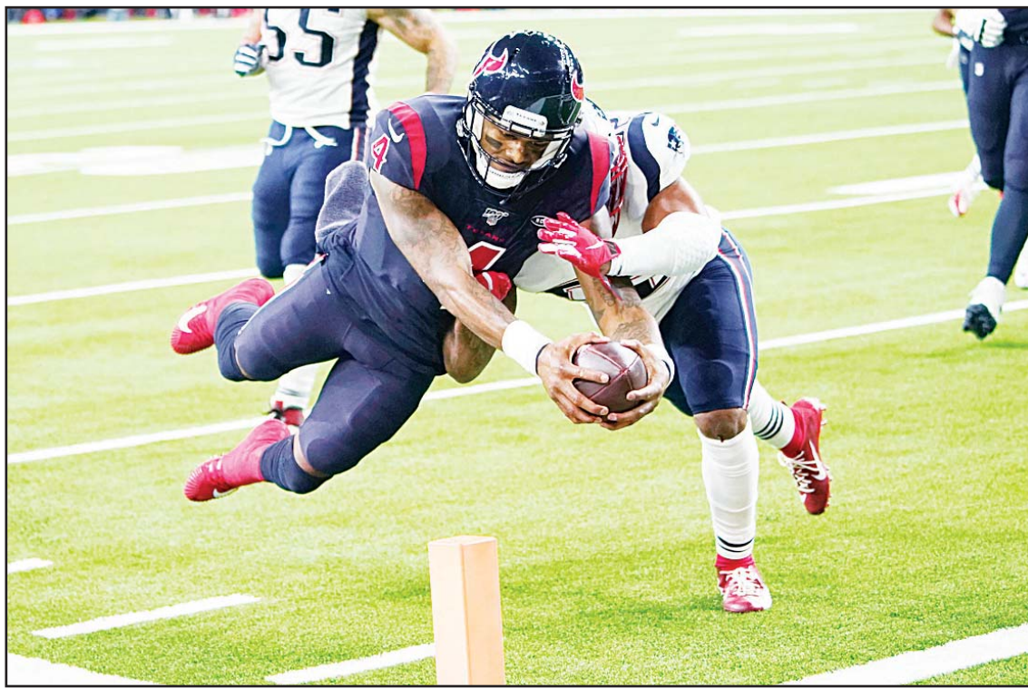
In this file photo, Houston Texans quarterback Deshaun Watson (4) dives past New England Patriots outside linebacker Elandon Roberts (52) to score a touchdown during the second half of an NFL football game on Dec 1 in Houston.

Giants host Miami (3-10) next Sunday. Eagles play at Washington (3-10) next Sunday.