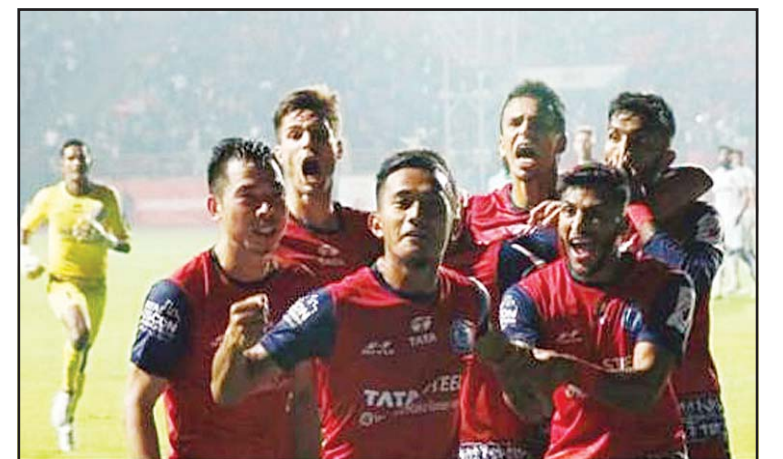
Jamshedpur FC players celebrate the equaliser against Chennaiyin FC.

"I can't wait for what 2020 will bring and am always proud to represent Canada at the highest level."