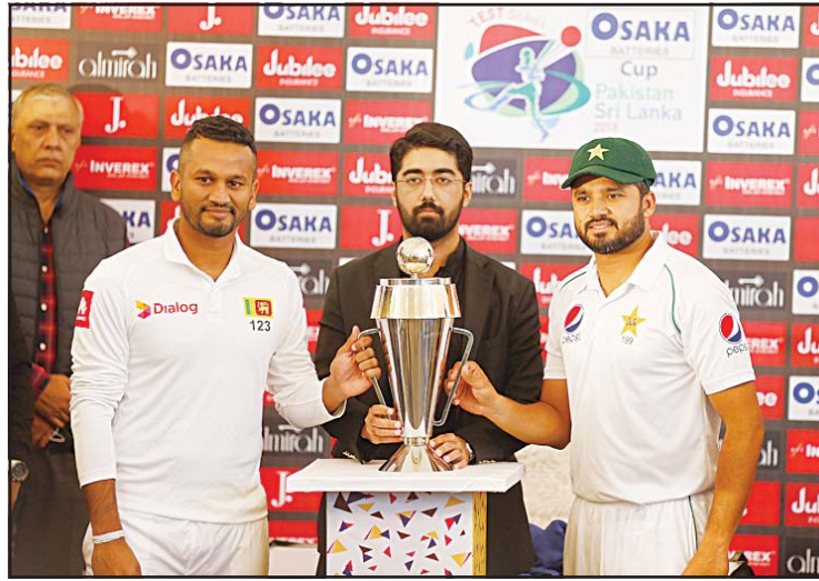
Sri Lankan Test team skipper Dimuth Karunaratne (left), and his Pakistani counterpart Azhar Ali (right), pose for a photo with the trophy of the cricket Test series after their press conference in Rawalpindi, Pakistan on Dec 10.

"It's a wonderful opportunity to get back on the winning track. We will try