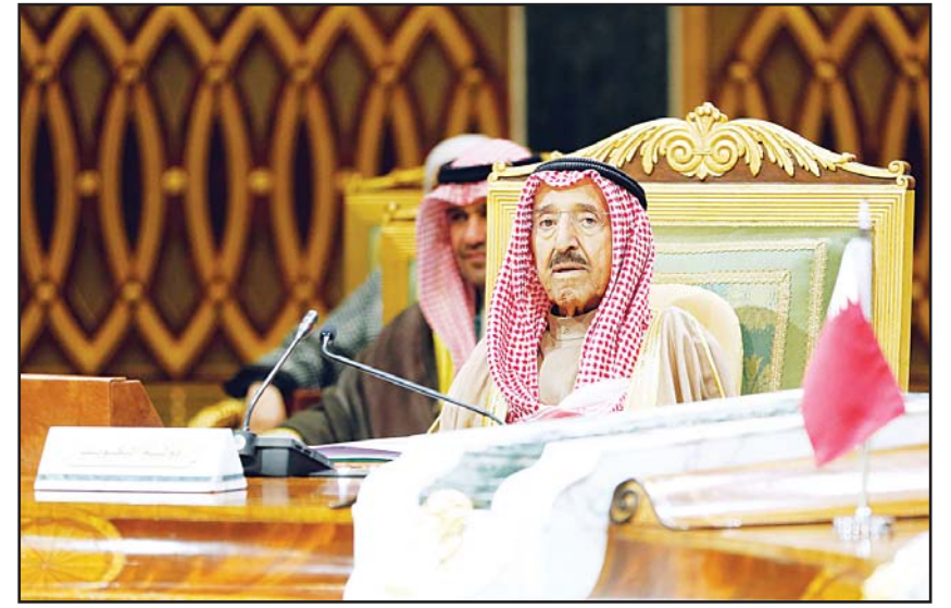
HH the Amir Sheikh Sabah Al-Ahmad Al-Sabah attends the 40th Gulf Cooperation Council Summit in Riyadh, Saudi Arabia, on Dec 10.

He urged the International Red Cross and Red Crescent Movement to concept activities of voluntary action in the next years through renewing a network of humanitarian field staff.