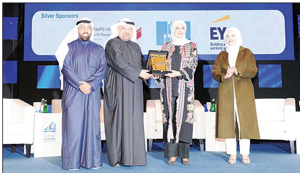
Acting Finance Minister and Minister of State for Economic Affairs Mariam Al-Aqeel being honoured