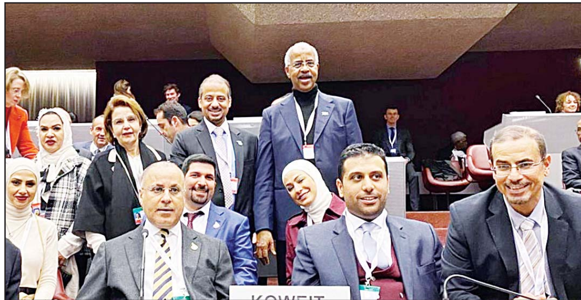
Kuwait Red Crescent Society delegation at the conference

He commended KRCS's efforts and its collaboration with ARCO and other international humanitarian organizations, saying that such cooperation benefits those who are in desperate need of help worldwide.