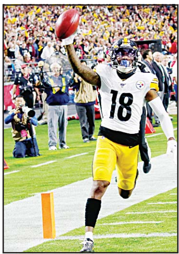
Pittsburgh Steelers wide receiver Diontae Johnson (18) runs in an 85-yard punt return for a touchdown against the Arizona Cardinals during the first half of an NFL football game on Dec 8 in Glendale, Ariz.

With an aggressive, inventive game plan on both sides of the ball, Los