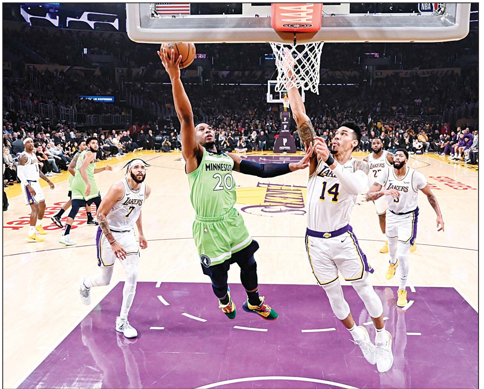
Minnesota Timberwolves' Josh Okogie (20) goes to the basket under pressure from Los Angeles Lakers' Danny Green (14) during the first half of an NBA basketball game on Dec 8 in Los Angeles.

Leonard played an outstanding all-around game, shooting 12-of-