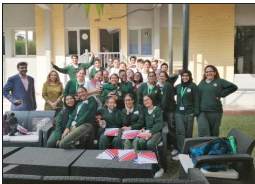
Photos from the event.

Dear Abby is written by Abigail Van Buren, also known as Jeanne Phillips, and was founded by her mother, Pauline Phillips. Contact Dear Abby at www.DearAbby.com or P.O. Box 69440, Los Angeles, CA 90069. (Source: Universal Uclick)