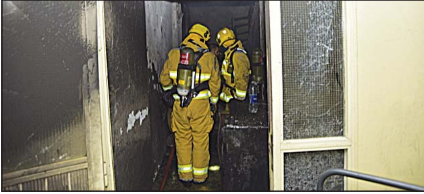
Firemen at the site of the blaze in Khaitan.