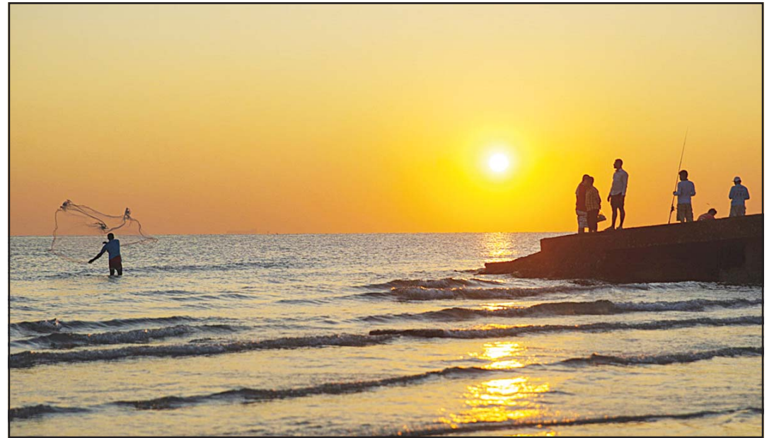
A fisherman casts his net during the early morning hours near Mahboula.

A case was registered, and investigations have been launched to find