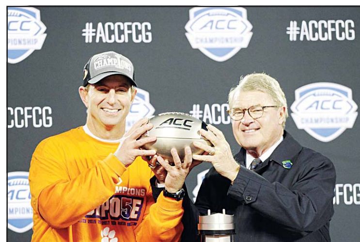
Clemson head coach Dabo Swinney (left) holds the trophy with ACC commissioner John Swofford following the Atlantic Coast Conference championship NCAA college football game against Virginia in Charlotte, NC on Dec 7.