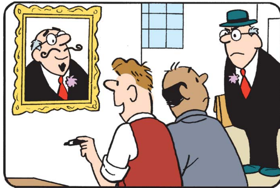
Differences: 1. Frame is moved. 2. Far is different. 3. Nose is smaller. 4. Mouth is open. 5. Wall is not as wide. 6. Boutonniere in picture is moved.