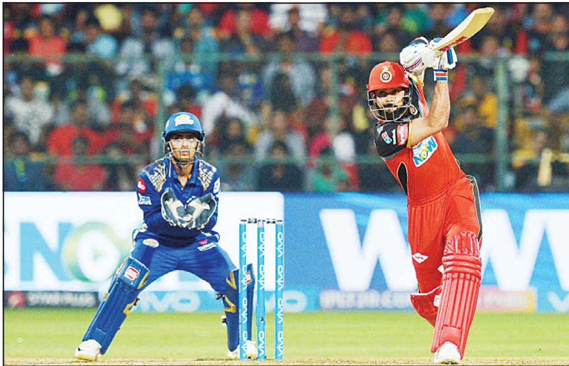
Royal Challengers Bangalore captain and batsman Virat Kohli (right), plays a shot while Mumbai Indians wicketkeeper Ishan Kishan looks on during the 2018 Indian Premier League (IPL) Twenty20 cricket match between Royal Challengers Bangalore and Mumbai Indians at the M. Chinnaswamy Stadium in Bangalore on May 1.