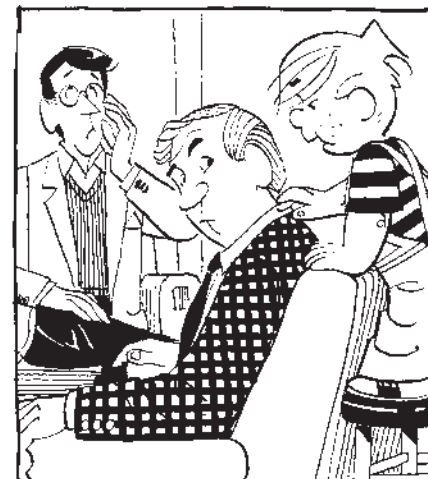
"MY DAD SAID YOU'VE GOT A CHIP ON YOUR SHOULDER. I JUST WANTED TO SEE IF IT'S A CHOCOLATE CHIP!"