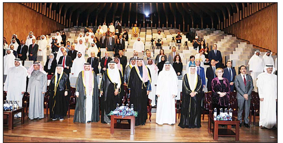
Part of the honouring ceremony.

In line with directives of the Award's sponsor, youth winners