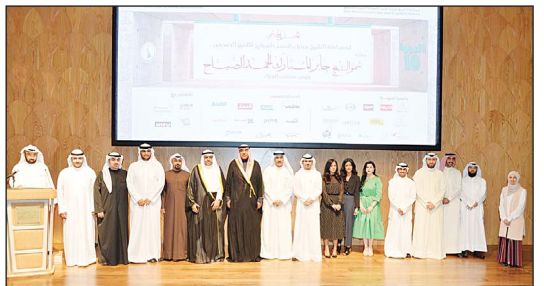
Group photo of the winners in the youth category.