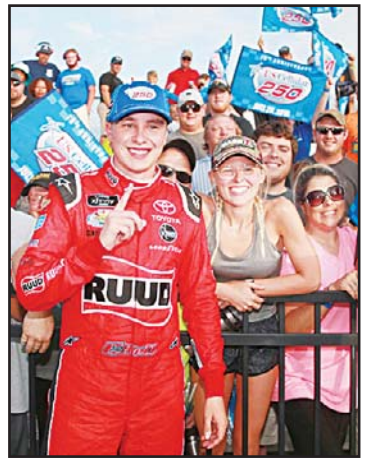
Christopher Bell, driver of the #20 Ruud Toyota, celebrates in Victory Lane after winning the NASCAR Xfinity Series US Cellular 250 presented by The Rasmussen Group at Iowa Speedway on July 28, in Newton, Iowa.

It was the seventh victory at Iowa for Joe Gibbs Racing and the first for Bell. "I was just praying for no yellow (flags) there on that long green flag run. When it came, it just became time to execute on restarts. I let one get away on me, but this thing was so good I was able to come from the second row," Bell said.