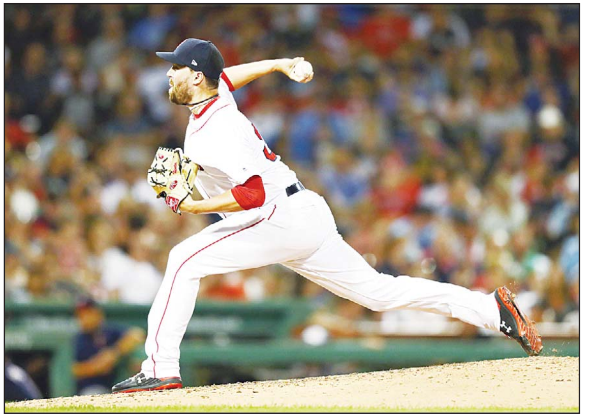
Heath Hembree #37 of the Boston Red Sox pitches at the top of the sixth inning of the game against the Minnesota Twins at Fenway Park on July 28, in Boston, Massachusetts.

Yankees 5, Royals 4, 2nd Game In New York, Greg Bird homered to