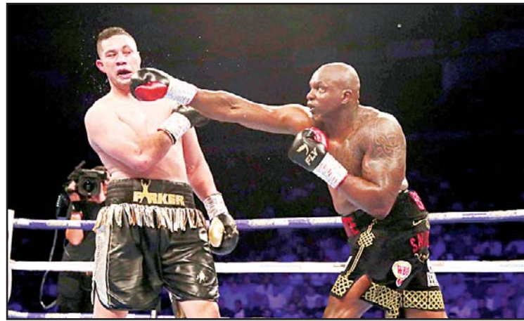
Dillian Whyte (right), connects with a punch against Joseph Parker during their heavyweight bout at the O2 Arena in London on July 28.

Parker threw caution to the wind in the final round and put Whyte down with less than 30 seconds to go, the Briton clambering to his feet and just