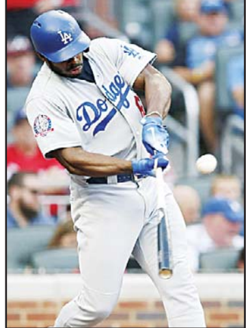
Right fielder Yasiel Puig #66 of the Los Angeles Dodgers hits a sacrifice fly in the second inning during the game against the Atlanta Braves at SunTrust Park on July 28, in Atlanta, Georgia.

Magneuris Sierra reached on a bunt single to start the 10th against Kelvin Herrera (1-1). Miguel Rojas tried to sacrifice, collided with catcher Spencer Kieboom leaving the box and was awarded first base for obstruction. A single by Brian Anderson loaded the bases.