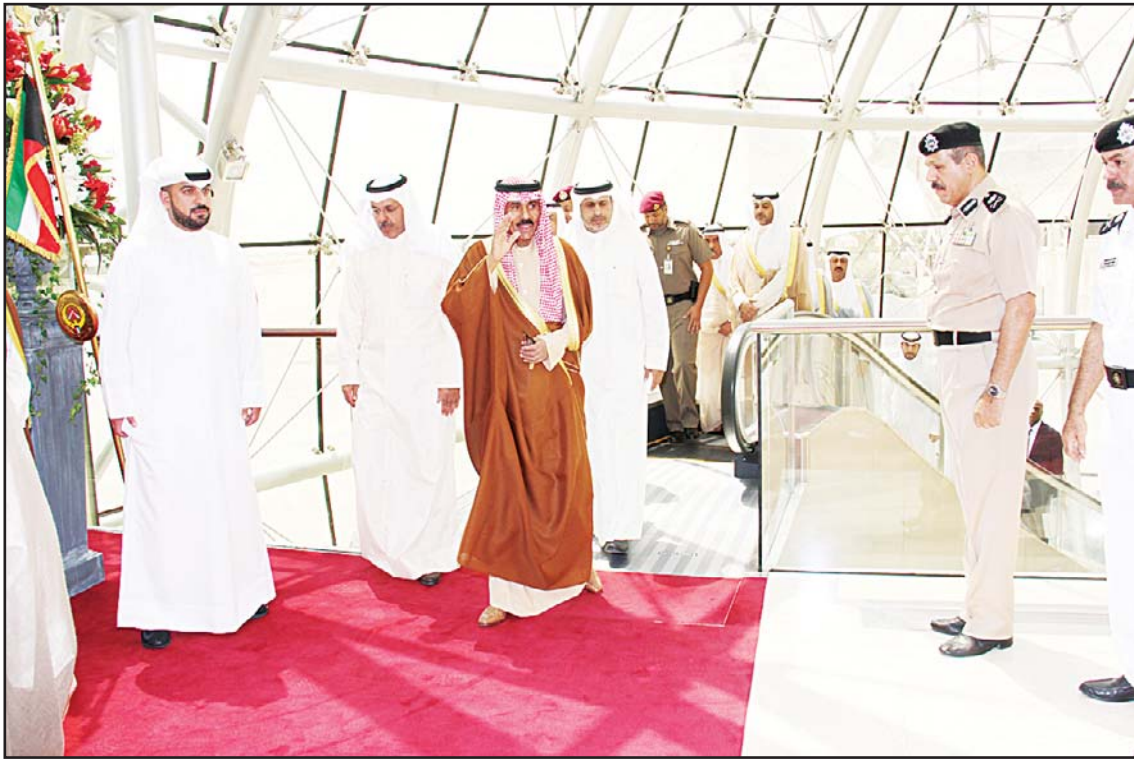
His Highness the Crown Prince Sheikh Nawaf Al-Ahmad Al-Jaber Al-Sabah left the country for a private vacation on Sunday. His Highness was seen off by senior sheikhs, Acting Prime Minister and Minister of Foreign Affairs Sheikh Sabah Al-Khaled Al-Hamad Al-Sabah and senior state officials.