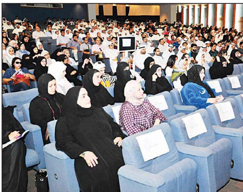
Top and above: Some photos from the event