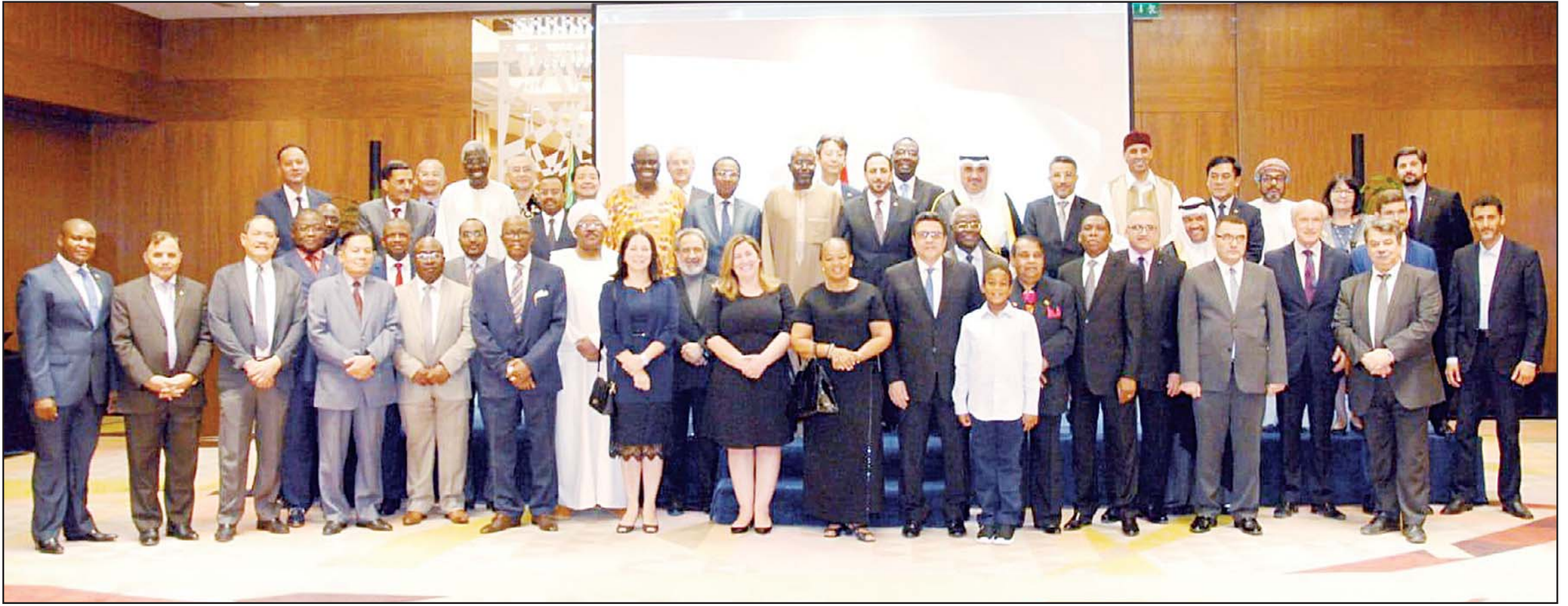
Group photo of attendees