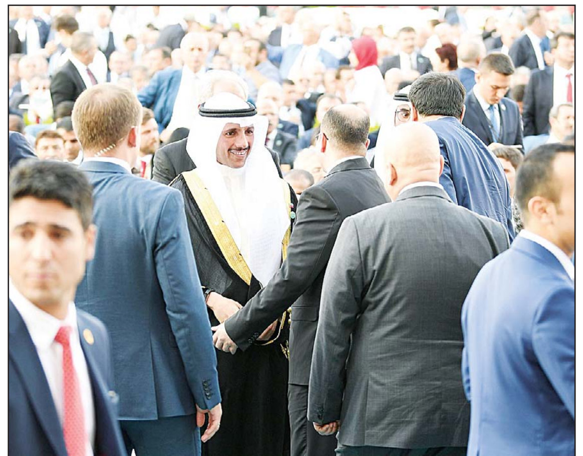
His Highness the Amir Sheikh Sabah Al-Ahmad Al-Sabah's representative, National Assembly Speaker Marzouq Al-Ghanim attended on Monday the inauguration of the Turkish President Recep Tayyip Erdogan. A number of presidents and senior officials have attended the ceremony that was held in the Presidential Complex in the Turkish capital Ankara.