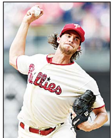
Philadelphia Phillies starting pitcher Aaron Nola throws during the third inning of the team's baseball game against the Baltimore Orioles, on July 4, in Philadelphia.

Seth Lugo (3-3) pitched three innings for the win. Jeury Familia earned his 16th save in 20 opportunities.