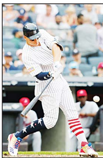
Aaron Judge #99 of the New York Yankees connects on a seventh-inning home run against the Atlanta Braves at Yankee Stadium on July 4, in the Bronx borough of New York City.

Wilmer Flores had two hits for the Mets, who had lost 11 of 13. Kendrys Morales homered for Toronto. Stroman was tagged for six runs and six hits in 4-2/3 innings.