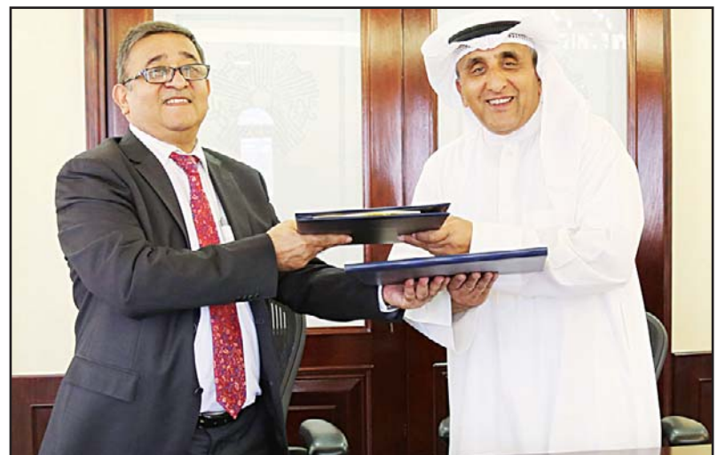
Top: the loan agreement being signed, and (above) signed document being exchanged.