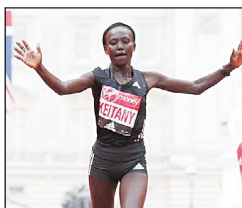
This file photo taken on April 23, 2017, shows Kenya's Mary Keitany winning the women's elite race at the London marathon in London.

At the halfway stage of last year's race, Keitany was a minute quicker than Radcliffe had been at the equivalent point in 2003 only for her pacemaker to drop out soon afterwards. Out in front on her own,