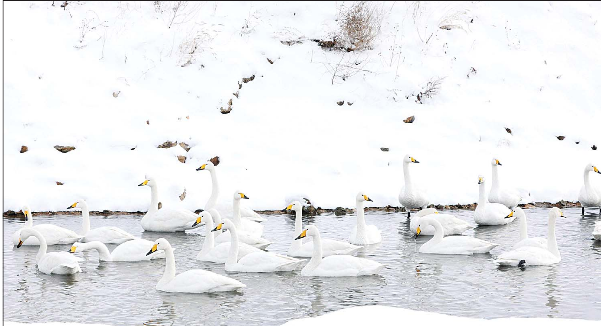
This photo taken on Jan 24 shows wild swans at the Swan Lake after a snowfall in Rongcheng national swan nature reserve in Rongcheng City, east China's Shandong province.