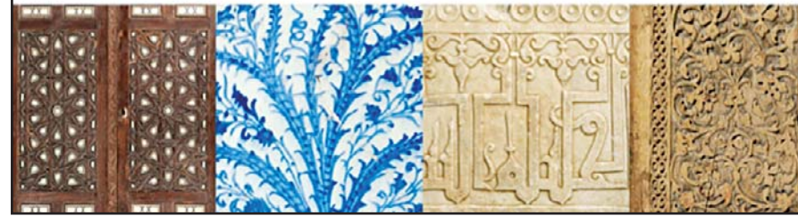
A flyer of the event.

Exhibition will be held from 14 th May till 23 rd June 2018 at DAI