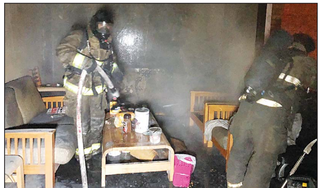
Firemen discussing plan to tackle the blaze.

Meanwhile, a citizen in his 20s was arrested by Capital securitymen in Sulaybiqhat area and handed over to concerned security authorities for evading five years jail term for a