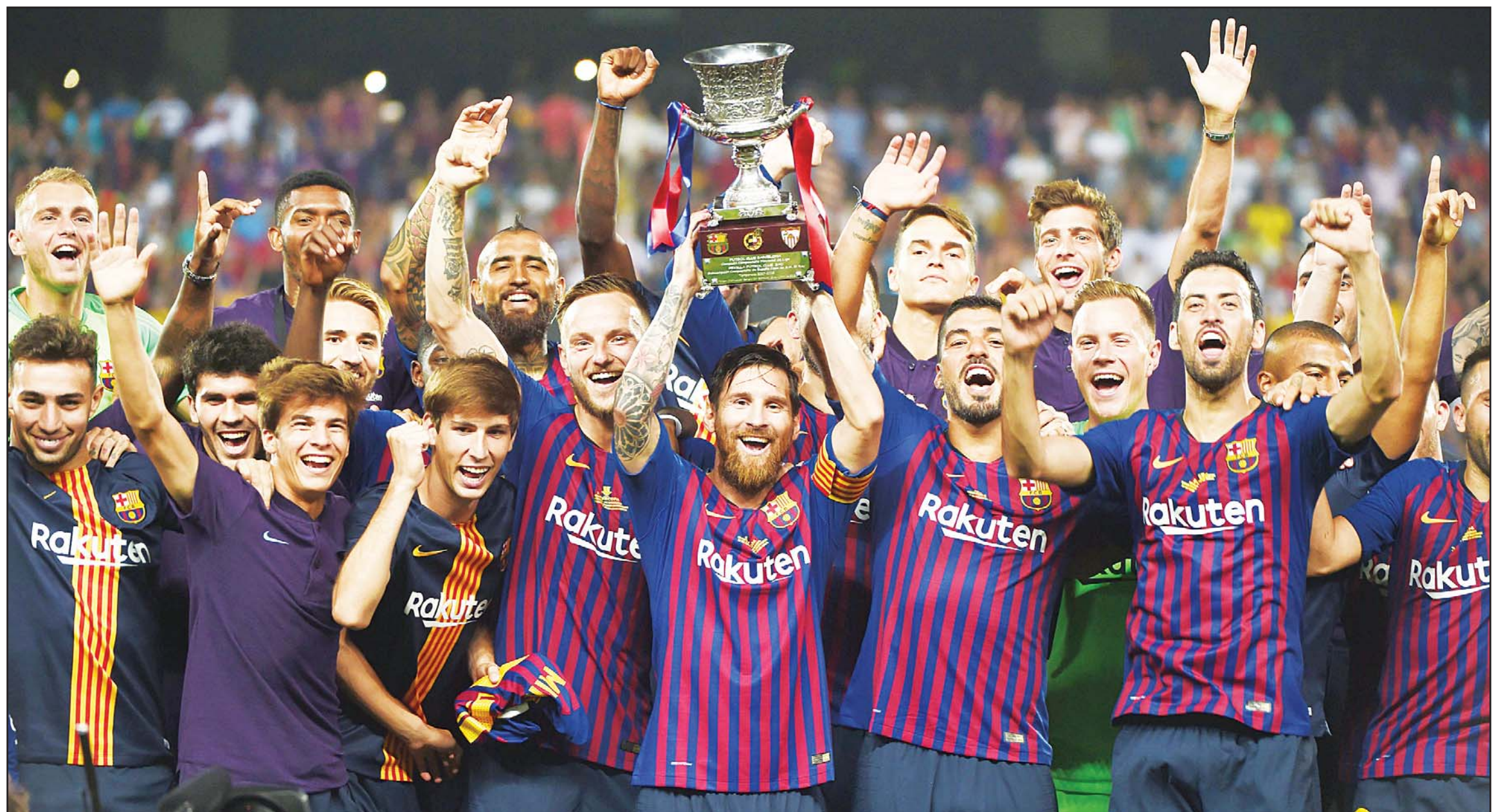
Barcelona players celebrate after beating Sevilla to win the Spanish Super Cup.