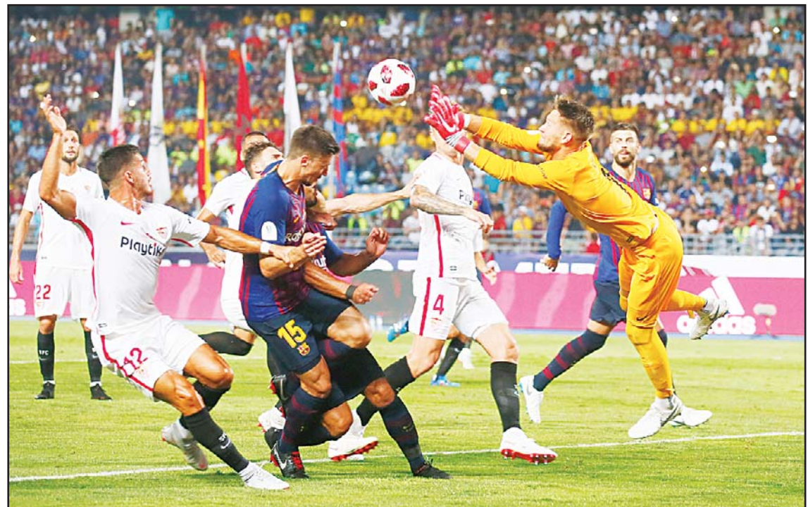
Sevilla goalkeeper Tomas Vaclik (right), leaps for a save during the Spanish Super Cup soccer match between Sevilla and Barcelona in Tangiers, Morocco, on Aug 12.

Sevilla qualified for the match as last season's Copa del Rey runners-up, after Barcelona won the league and cup double.