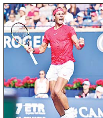
Rafael Nadal of Spain celebrates after defeating Stefanos Tsitsipas of Greece during the championship men's finals Rogers Cup tennis action in Toronto on Aug 12 in Montreal.