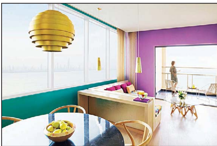
Grand Suite lifestyle

KUWAIT CITY, Aug 13: Zain, the leading telecommunications company in Kuwait, participated in awarding the winners of the best project ideas as part of the KON Social Entrepreneurship Program during the conclusion ceremony held at the American University of Kuwait. The program, brought to Kuwait in collaboration with Babson College in Boston, came as part of Zain's Strategic Partnership of LoYAC.