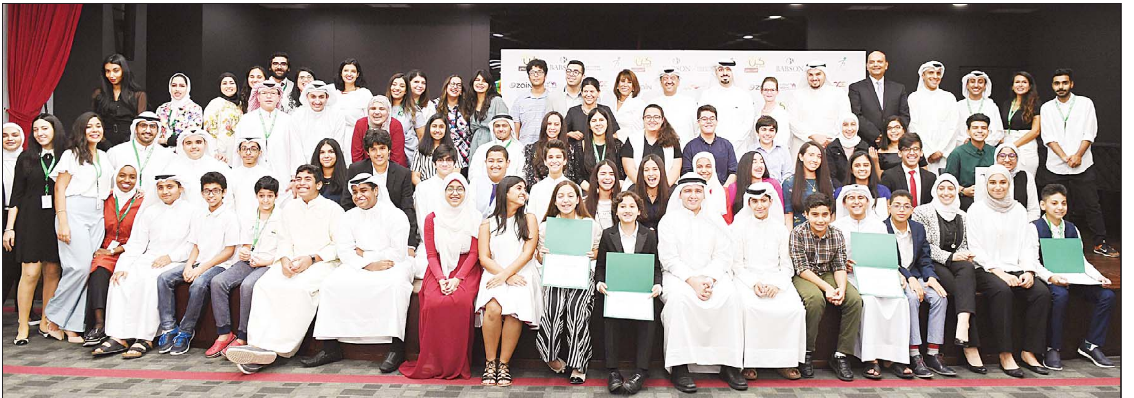
Zain and LoYAC officials with KON students.

The economic problems being faced by Pakistan and the complex issues confronting it can only be overcome if we follow the teachings of the Quaid-e-Azam and Allama Iqbal in their true spirit.