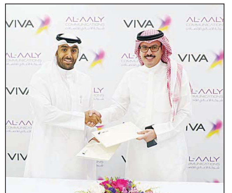
VIVA and Al-Aaly signing ceremony

The QX70, also up for a special leasing price starting at KD 275 per month comes with exterior enhancements, LED daytime running lights along with unique 21x9.5-inch multi-spoke premium paint-finished aluminum-alloy wheels mounted with 265/45R21 V-rated all-season tires. The QX70 is powered by a 329-horsepower 3.7-liter V6 with VVEL (Variable Valve Event & Lift). The engine is matched with a 7-speed automatic transmission featuring Adaptive Shift Control (ASC).