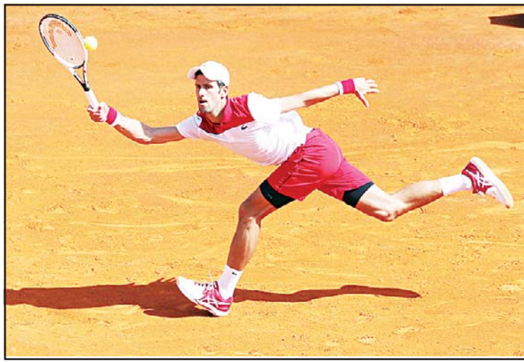
Serbia's Novak Djokovic returns a ball to compatriot Dusan Lajovic during their round of 64 tennis match at the Monte Carlo ATP Masters Series Tournament on April 16, in Monaco.

Other winners included Roberto Bautista Agut of Spain, Milos Raonic of Canada, Andrey Rublev of Russia,