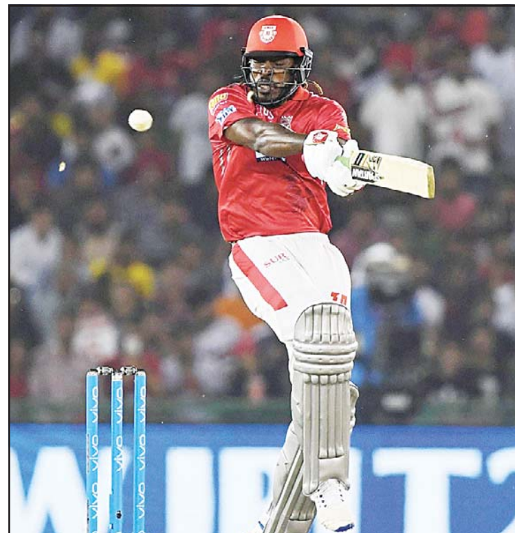
Kings XI Punjab cricketer Chris Gayle plays a shot during the 2018 Indian Premier League (IPL) Twenty20 cricket match between Kings XI Punjab and Chennai Super Kings at the Punjab Cricket Association Stadium in Mohali.

took 3-18, all of his wickets in the last over. Delhi's chase stuttered at 24-3.