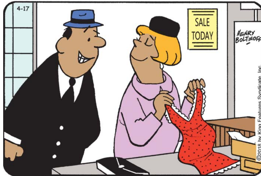
Find at least six differences in details between panels.