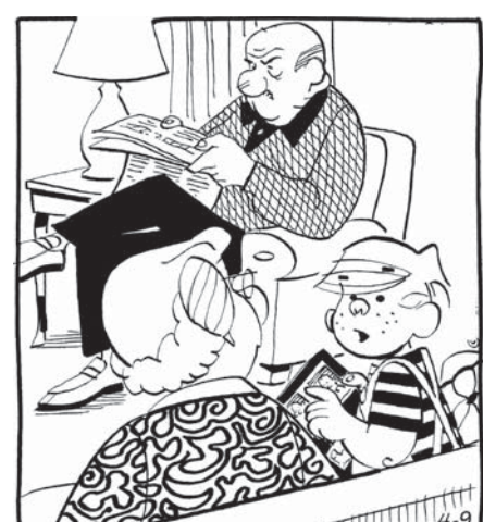
"How old was Mr. Wilson when he became a Grouch?"

٧٨٣٩ Sabat alaf wa thaman maaha wa tessah wa thalathoun