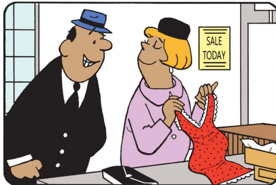
Differences: 1. Counter is longer. 2. Arm is moved. 3. Sign is lower. 4. Hat is tilted. 5. Button is added. 6. Pinky is moved.