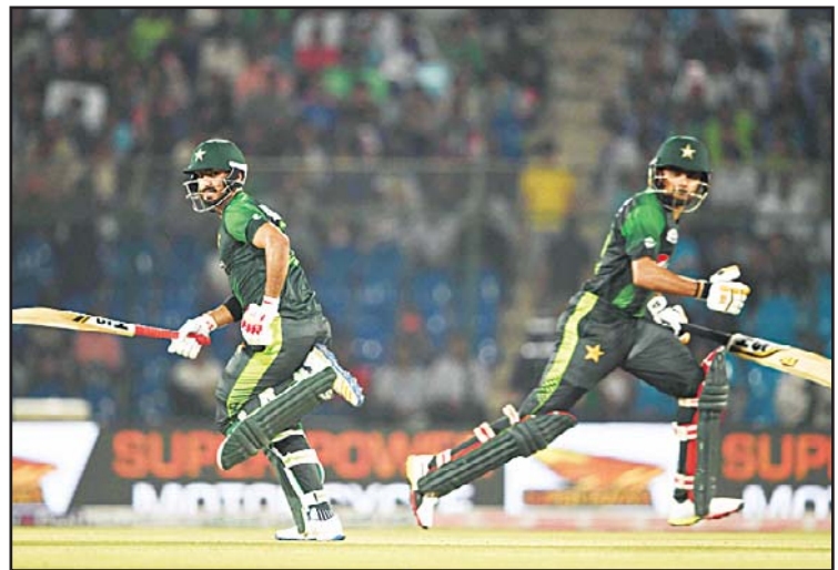
Pakistani batsmen Hussain Talat (left), and Babar Azam run between the wickets during the second Twenty20 (T20) International cricket match between Pakistan and West Indies at the National Cricket Stadium in Karachi on April 2.

The opener put on 119 for the second wicket with Hussain Talat, who notched a 41-ball 63 with eight boundaries and a six.