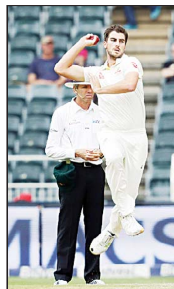
Australia's bowler Pat Cummins (front), in his bowling spell as empire Nigel Llong of England, watches on during day four of the fourth cricket Test match between South Africa and Australia at the Wanderers Stadium in Johannesburg, South Africa on April 2.