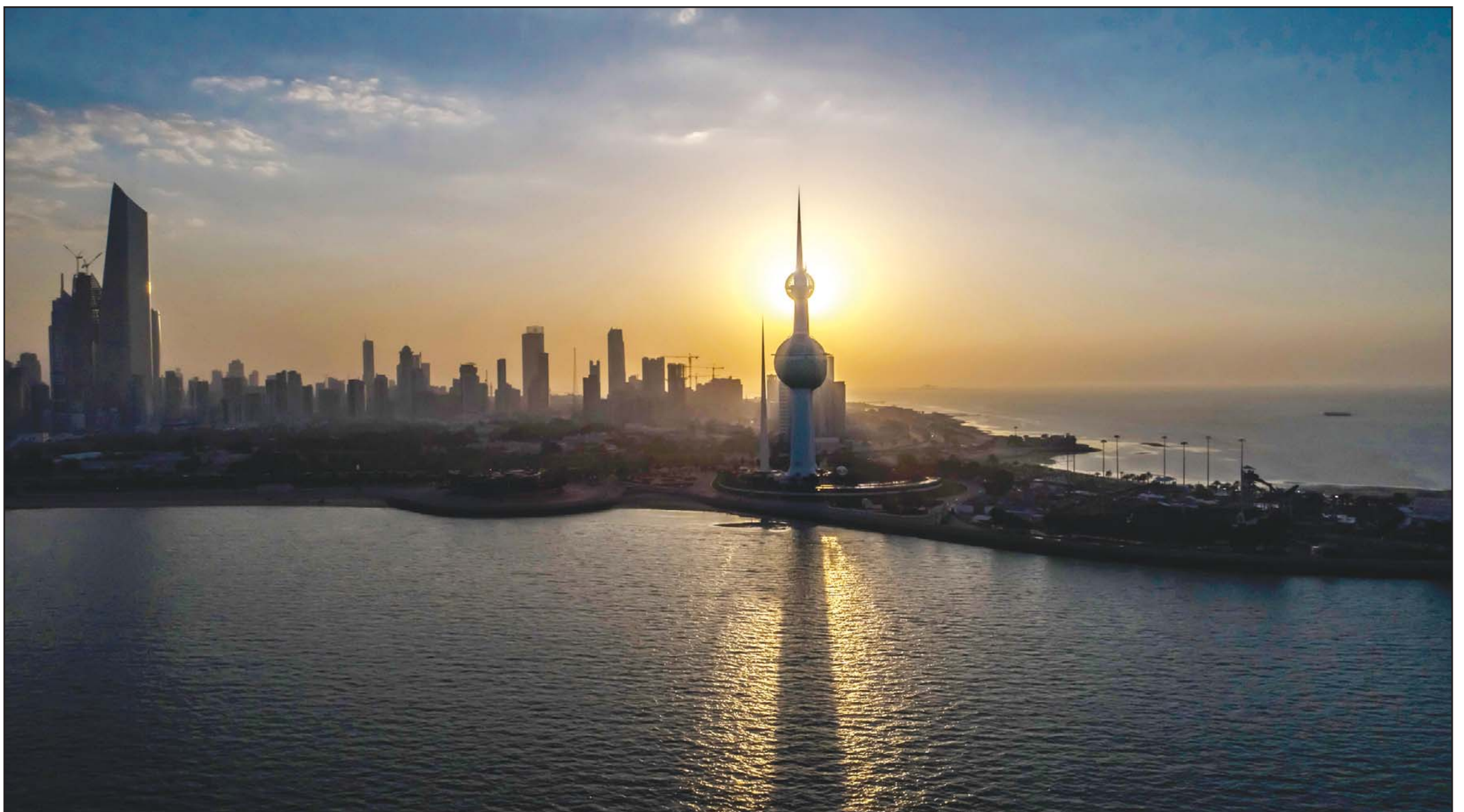
Sun's rays sparkling in gold behind Kuwait Towers, (Musa'ed Al-Ghariba — KUNA)