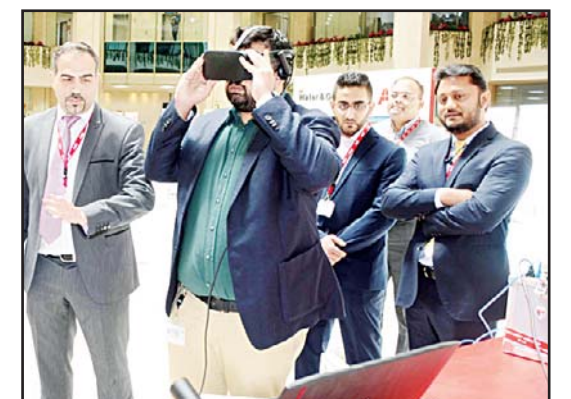
Photos from the recently inaugurated exhibition.