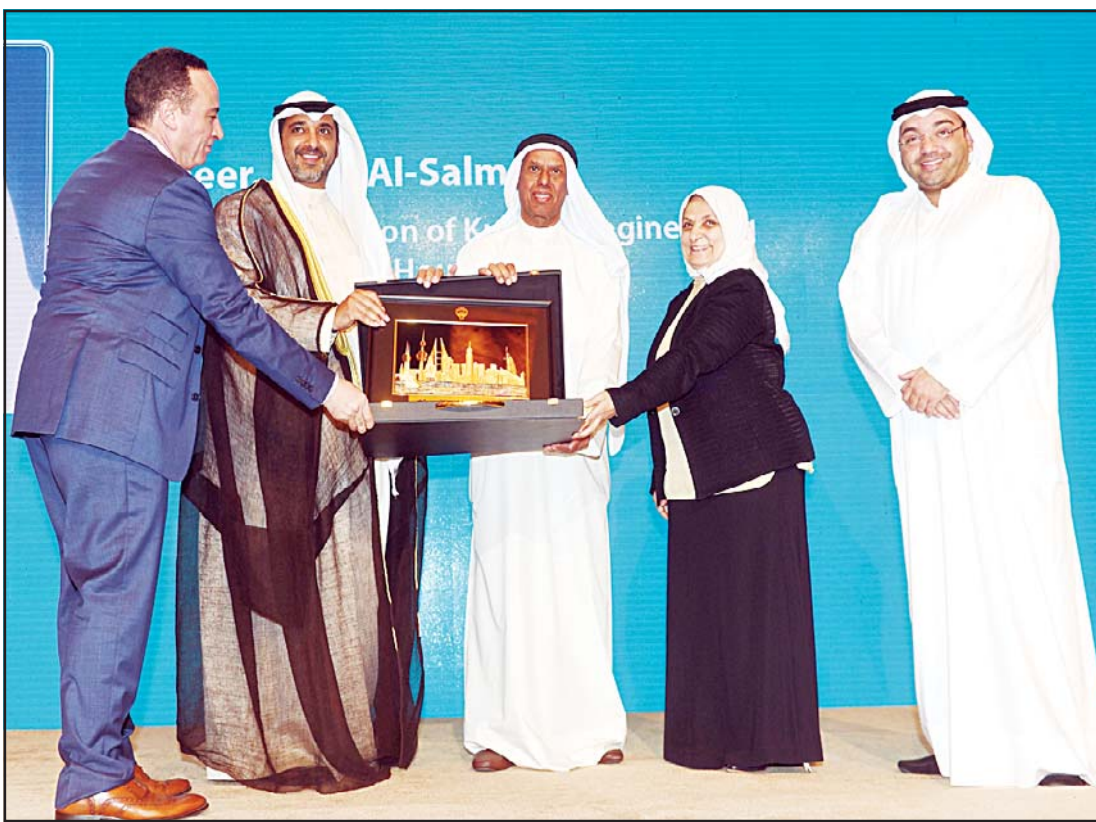
Minister of State for Cabinet Affairs and Acting Minister of Information Sheikh Mohammad Al-Abdullah Al-Mubarak Al-Sabah during the first forum of consulting services for government projects.

KUWAIT CITY, Sept 18, (KUNA): Minister of State for Cabinet Affairs Sheikh Mohammad Al-Abdullah Al-Sabah said Sunday the government sector is the driving force fueling economic growth in the member states of the Gulf Cooperation Council (GCC).