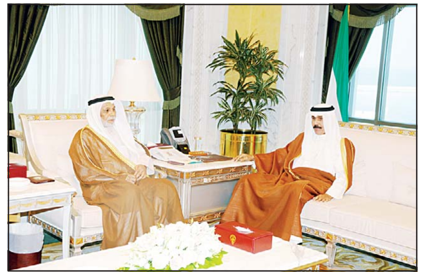
HH the Deputy Amir and Crown Prince receives Justice Yousef Jassem Al-Mutawaa at Seif Palace.