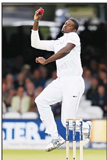
West Indies' captain Jason Holder bowls on the first day of the third Test match between England and the West Indies at Lord's cricket ground in London on Sept 7.

"We are still a work in progress and hopefully more players are coming