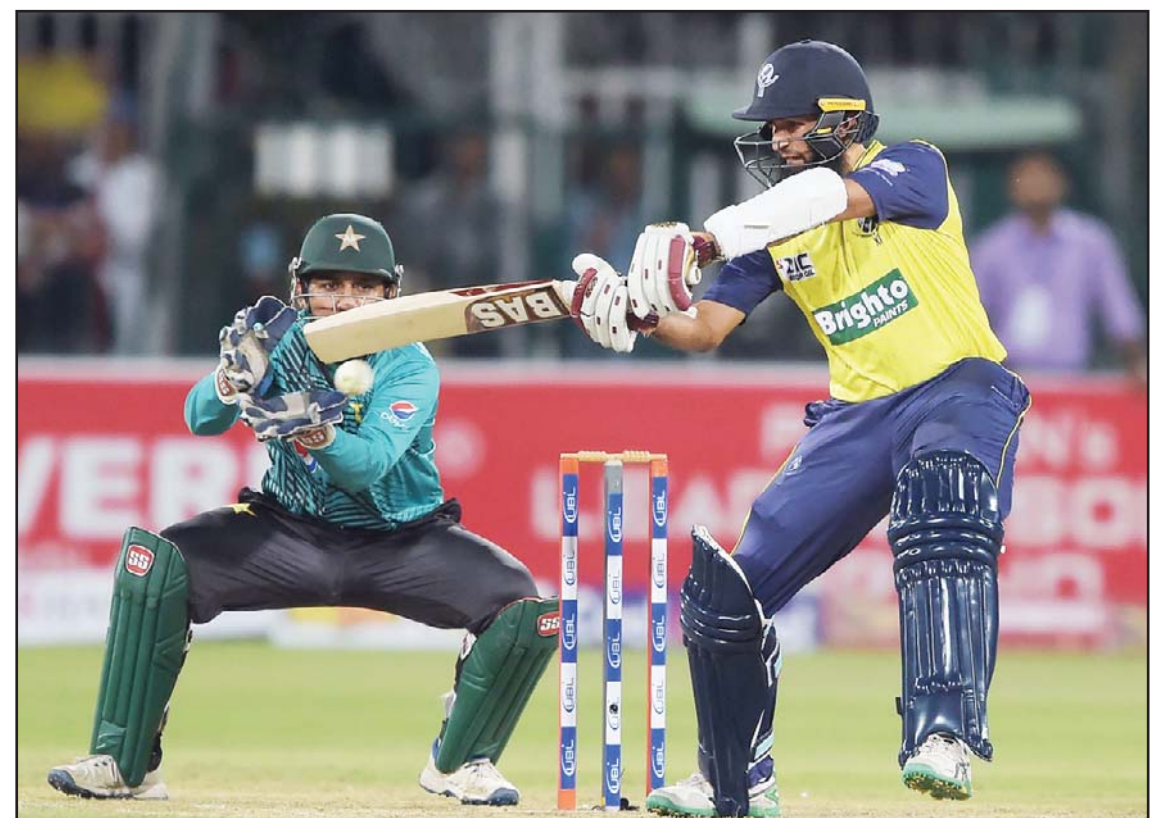
World XI batsman Hashim Amla (right), plays a shot as Pakistani captain and wicketkeeper Sarfraz Ahmed looks on during the second Twenty20 international cricket match between the World XI and Pakistan at The Gaddafi Cricket Stadium in Lahore on Sept 13.