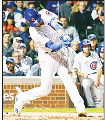
Chicago Cubs' Kris Bryant hits a three run home run against the New York Mets during the fourth inning of a baseball game in Chicago on Sept 12.

The LPGA announced in October of last year that it was partnering with Alisports of Shanghai, a division of Alibaba Group, to own an LPGA tournament hosted annually in mainland China for the next 10 years.