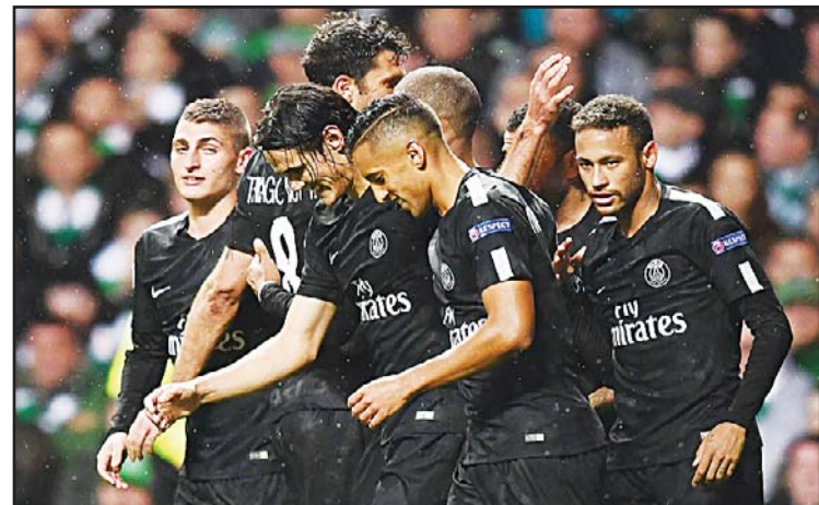
Paris Saint-Germain's Brazilian striker Neymar (right), celebrates with teammates after scoring the opening goal of the UEFA Champions League Group B football match between Celtic and Paris Saint-Germain (PSG) at Celtic Park in Glasgow, on Sept 12.

with the hosts 3-0 down and darted towards 18-year-old superstar Kylian Mbappe. He aimed a fresh-air kick at the former Monaco striker but failed to make contact before being whisked away by stewards. Celtic have been charged with a count of "field invasion" and will have their case heard by the UEFA Control, Ethics and Disciplinary Body on Oct 19, a UEFA statement said. Celtic have already been fined 11 times in less than six years over fan-behaviour issues ranging from pro-IRA chants to firework, crowd disturbances and illicit banners. PSG have also been charged after their fans were accused of breaking seats at Celtic Park and will have their matter addressed at the same hearing as Celtic. Celtic manager Brendan Rodgers expressed his frustration with Tuesday night's incident and said the Parkhead club would take its own action. "The crowd reaction said it all. It is disappointing at any ground that a supporter gets on to the pitch," he said. "I am sure the club will deal with that. It shouldn't be anything that we should see on a football field. The crowd in their reaction told you everything you need to know." Police said they made seven arrests at Celtic Park, including a 21-year-old man accused of an alleged pitch incursion and assault. Four men are expected to appear in court later Wednesday. UEFA has also opened proceedings against Basel after fans set off fireworks at Old Trafford on Tuesday. The Swiss club lost 3-0 to Manchester United.