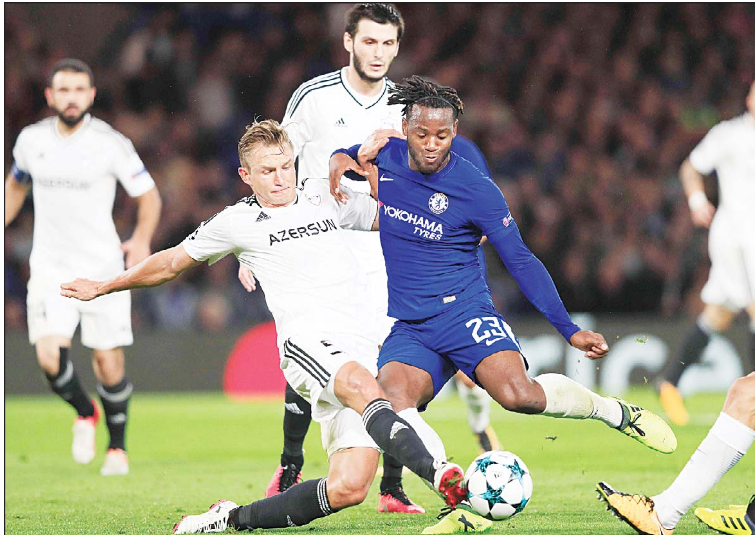
Qarabag's Azerbaijani defender Maksim Medvedev (left), vies with Chelsea's Belgian striker Michy Batshuayi during the UEFA Champions League Group C football match between Chelsea and Qarabag at Stamford Bridge in London on Sept 12.