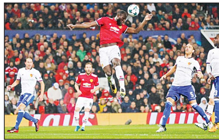
Trafford and the French midfielder looks certain to miss United's Premier League clash at home against Everton on Sunday.

than the Swiss. "I keep saying the same, Fellaini is a player with special qualities he does things that other players cannot do. He gives me a multiple area of actions and positions and philosophy on the pitch and is one of my most important players." Mourinho was pleased to welcome back wing back Ashley Young who provided the cross for Fellaini's opener on his first match since injuring himself in the Europa League semifinal, second leg against Celta Vigo in May. Paul Pogba faces "a few weeks" on the sidelines after injuring his hamstring. Pogba was taken off after 18 minutes against the Swiss team at Old