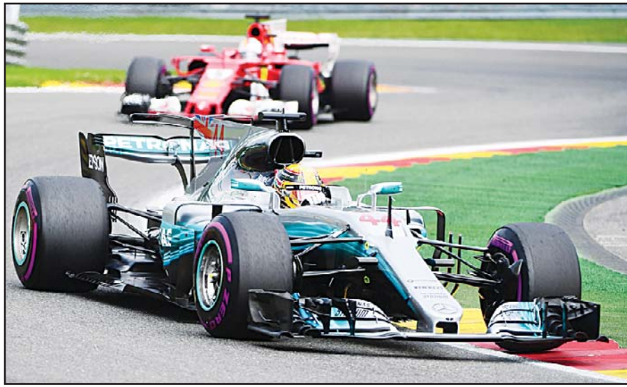
This file photo taken on Aug 27, 2017 shows Mercedes' British driver Lewis Hamilton driving ahead of Ferrari's German driver Sebastian Vettel during the Belgian Formula One Grand Prix at the Spa-Francorchamps circuit in Spa.

But Wolff added: "We have made good progress in understanding what we need to do in order to get the most from the chassis ... It's a weekend when every part of the team needs to be at its best if you wish to score a strong finish.