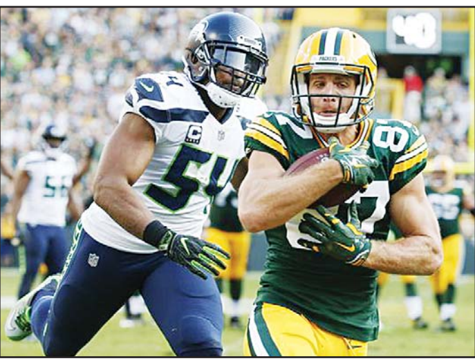
Green Bay Packers' Jordy Nelson catches a touchdown pass in front of Seattle Seahawks' Bobby Wagner during the second half of an NFL football game on Sept 10, in Green Bay, Wisconsin.