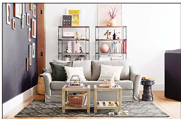
Photo of Small Space collection

For more information about Warba Bank's latest services, products and offers, customers are encouraged to visit any of our 12 branches across the State of Kuwait, visit our website ( www.warbabank.com ), or call the Customer Call Centre at 1825555 (available 24/7).