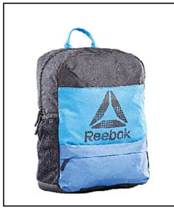
'Back to School' collection

style quotient, glitter-strewn uppers, bows and floral imprints on formal black shoes will leave your princesses spoilt for choice. Printed insoles with Barbie, Disney Princesses, Anna & Elsa of Frozen and the all-time BFF, Minnie Mouse make for a rather attractive padding to put their feet in, allowing a sense of comfort and style