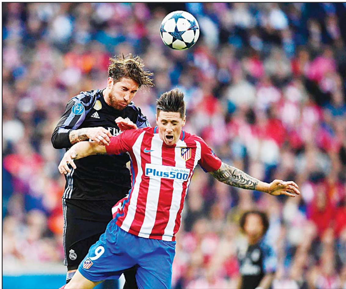
Real Madrid's defender Sergio Ramos (left), vies with Atletico Madrid's forward Fernando Torres during the UEFA Champions League semifinal second leg football match Club Atletico de Madrid vs Real Madrid CF at the Vicente Calderon Stadium in Madrid on May 10.

The fans pushed the hosts on from the start and after 12 minutes Saul Niguez headed home. Antoine Griezmann added the second from the penalty spot four minutes later, sending the stadium into overdrive.