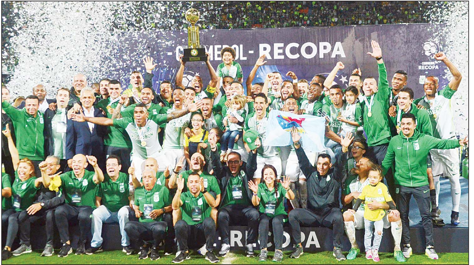
Players of Colombia's Atletico Nacional lift the trophy after winning the Recopa Sudamericana final soccer match against Brazil's Chapecoense in Medellin, Colombia on May 10.

The match, which was postponed during a furious diplomatic row over the murder of the North Korean leader's half-brother in Malaysia, has been rescheduled to June 8.