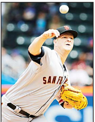
San Francisco Giants' Matt Cain delivers a pitch during the first inning of a baseball game against the New York Mets on May 10, in New York.