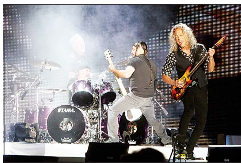
James Hetfield (from left), Lars Ulrich, Robert Trujillo and Kirk Hammett of the band Metallica perform in concert during the WorldWired Tour at M&amp;T Bank Stadium on May 10 in Baltimore.

Spanish media reported he had died in Ibiza where he lived.