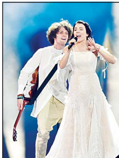
Belarus' Naviband performs the song 'Story of My Life' during the second semifinal dress rehearsal of the Eurovision Song Contest 2017 on May 10, at the International Exhibition Centre in Kiev.