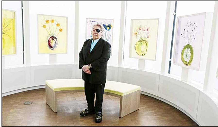
In this May 19, 2017 photo, glass artist Dale Chihuly poses for a picture in front of his 'Glass on Glass' pieces in a reflection room at the Fred & Pamela Buffett Cancer Center in Omaha, Nebraska.