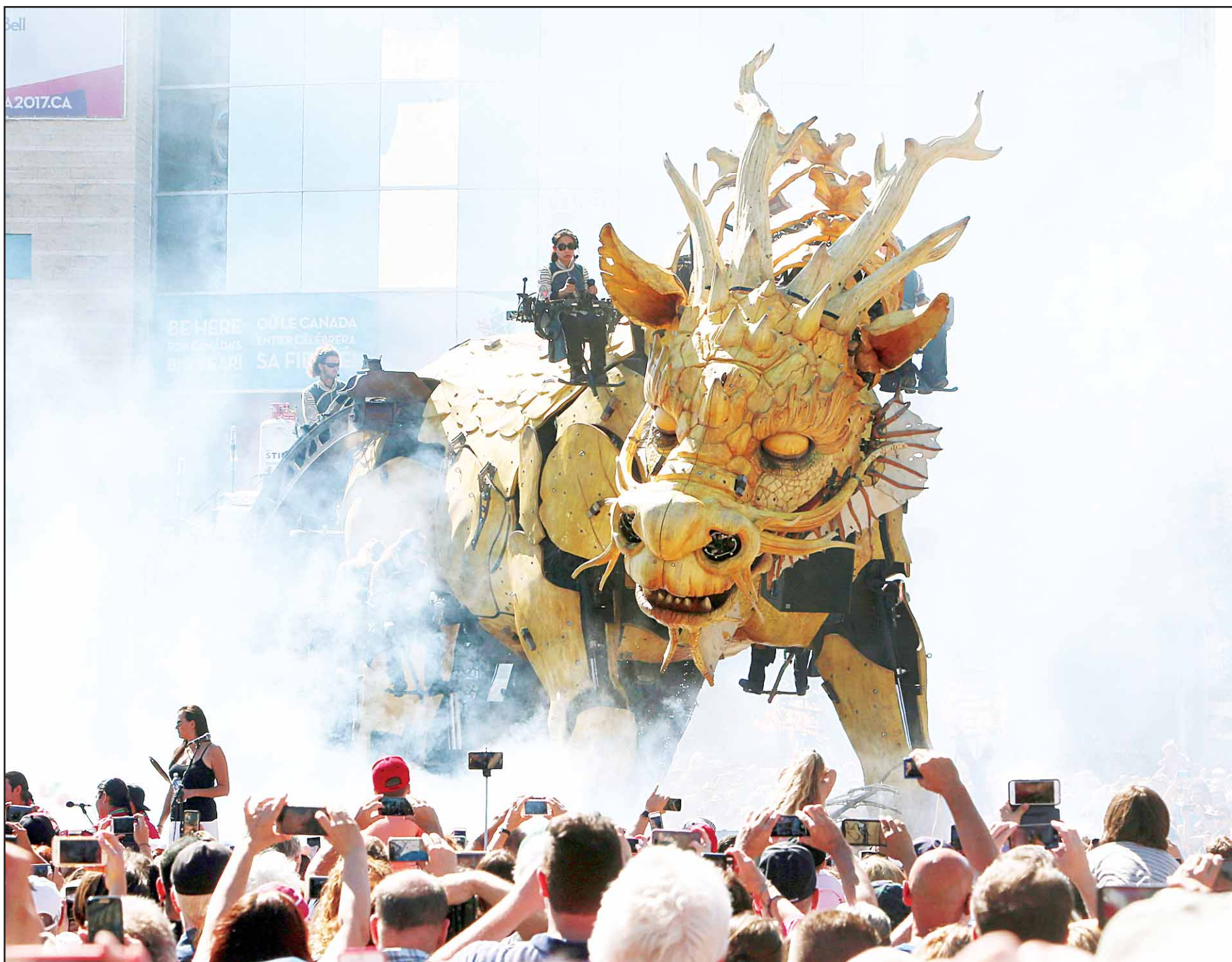
A giant mechanical dragon gets ready to roam the streets of Ottawa in a four-day urban theatre performance involving a 45-ton half-dragon half-horse that towers 12 meters high. Long Ma, named after a Chinese mythological half-dragon half-horse, is shown leaving the ground of Ottawa's City Hall on July 28.