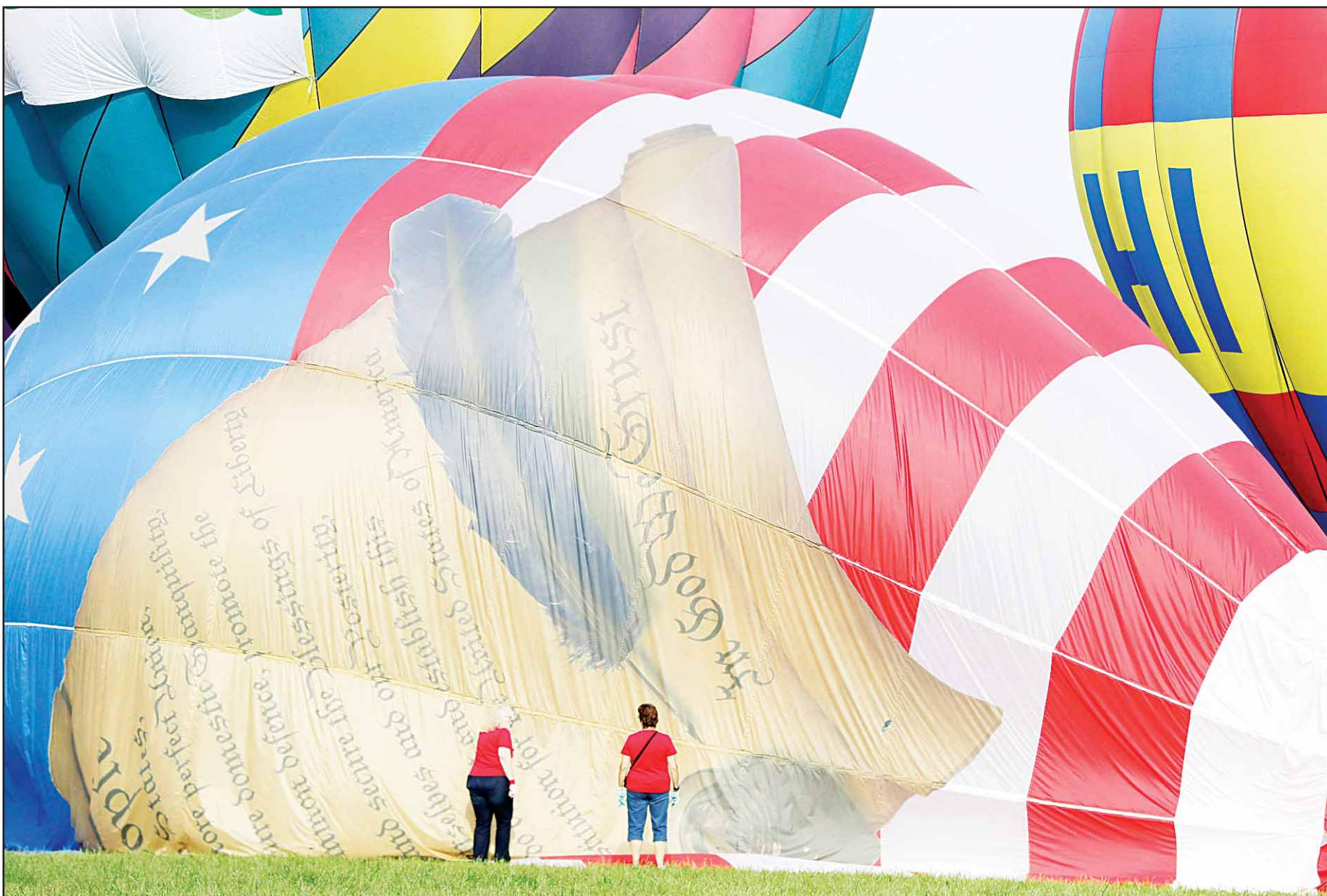
Women help deflate a balloon with a painting of the United States Constitution during the first day of the QuickChek New Jersey Festival of Ballooning on July 28, in Readington Township, NJ.