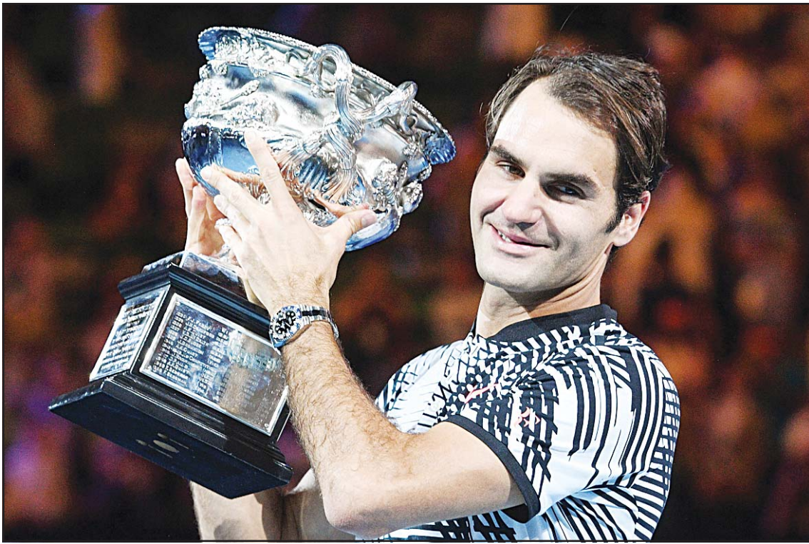
Switzerland's Roger Federer celebrates with the championship trophy during the awards ceremony after his victory against Spain's Rafael Nadal in the men's singles final on day 14 of the Australian Open tennis tournament in Melbourne on Jan 29.

serve easily. Even if I played great in the break points, I was suffering a lot," said Nadal. "He probably remained a little bit more free on points on my serve. That's what I needed in that moment, and I didn't have." With Federer's contemporary Serena Williams having won the women's title for the seventh time on Saturday, the 2017 Australian Open is destined to be remembered as the retro slam. Federer gave a reminder that no one is immune to the ravages of time, however. "Now it's time to celebrate in a massive way," he said. "(But) at 35 years old, I don't like to say it, but I'm so old and so the body hurts, it aches."