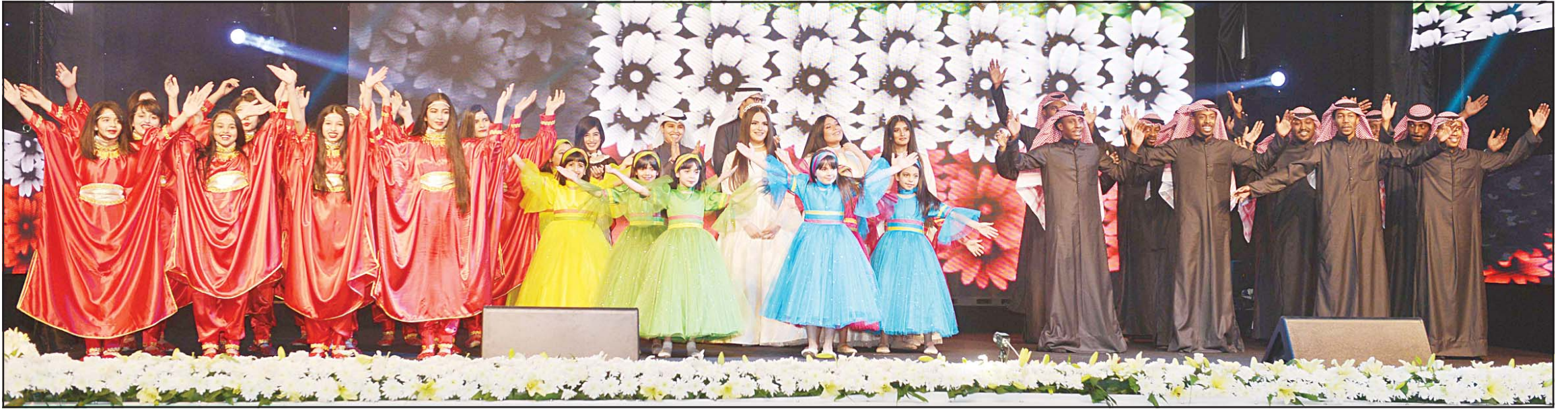
Dancers perform during the opening ceremony of HH the Amir of Kuwait Sixth International Shooting Grand Prix, 2017. — Details Page 40

Latest sports scores at — http://sports.arabtimesonline.com