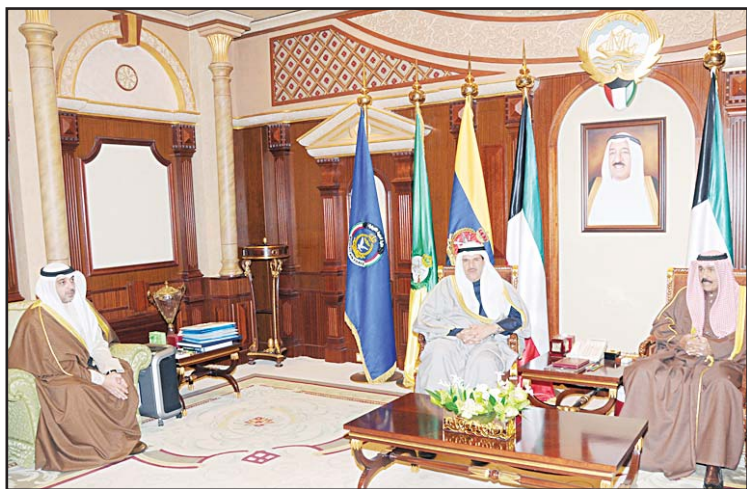
His Highness the Crown Prince received Minister of Information and minister of State for Youth Affairs Sheikh Salman Sabah Al-Salem and minister of State for Cabinet Affairs Sheikh Mohammad Abdullah Al-Sabah.

Khaled Hamad Al-Sabah. Later, Sheikh Nawaf received Deputy Prime Minister and Minister of Defence Sheikh Mohammad Khaled Hamad Al-Sabah. His Highness the Crown Prince also received Deputy Prime Minister and Minister of Interior Sheikh Khaled Jarrah Al-Sabah. Sheikh Nawaf received at Bayan Palace Deputy Prime Minister and Minister of Finance Anas Al-Saleh.