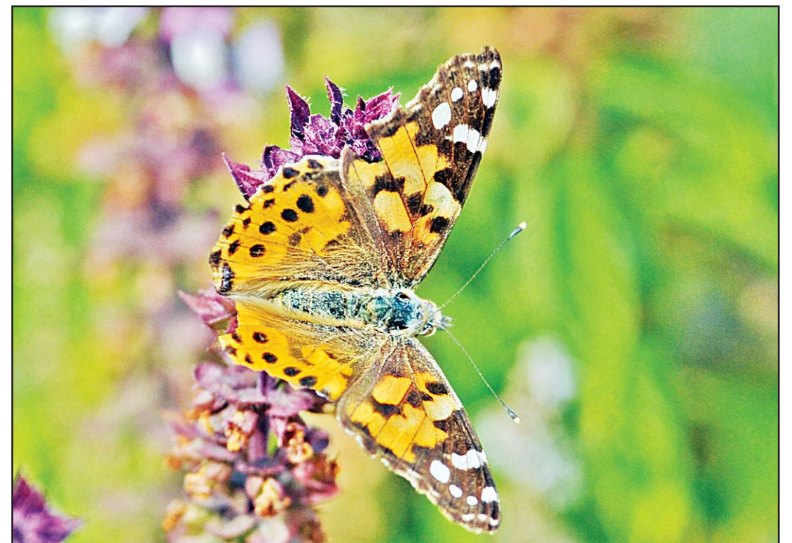
A multicolored butterfly captured in a photo.

The diplomat is said to have withdrawn the complaint to save her efforts of going to the police station