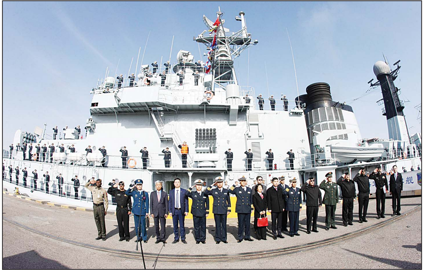
Chinese officers from the 24th Chinese navy pose for a picture with Kuwaiti officials next to a Harbin destroyer, which arrived as part of the Chinese fleet at Shuwaikh Port in Kuwait City on Feb 1.