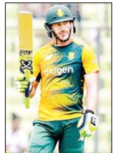
A file photo of South Africa's cricketer Faf du Plessis.

we feel he isn't quite there, there's still time to get him ready between now and the first Test against India."