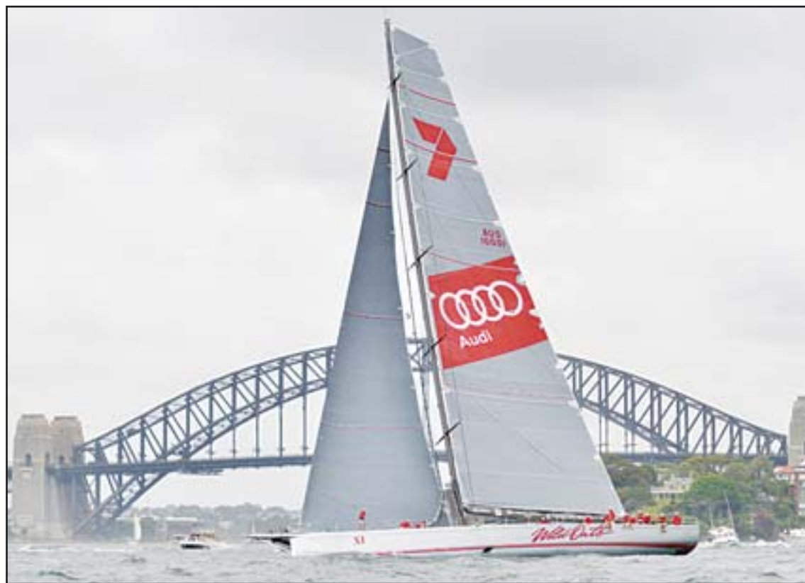
A file photo taken on Dec 9, 2014 shows Australian supermaxi yacht Wild Oats leading during the Big Boat Challenge on Sydney Harbour.

Ball, the second pick overall in the 2017 NBA draft, is averaging 10 points and 6.9 assists through the first 31 games of his NBA career.