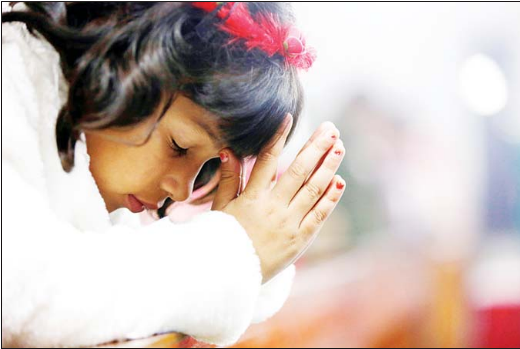
An Indian girl prays during the midnight Christmas Mass at Saint Joseph's Cathedral in Lucknow, India on Dec 25. While Hindus and Muslims comprise the majority of the population, Christmas is also observed as a national holiday in India.