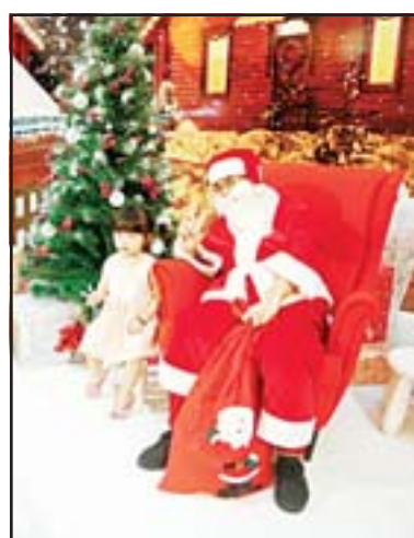
A man dressed as Santa Claus (right), poses for photos on Christmas day at a shopping mall in Petaling Jaya, Malaysia on Dec 25. Shopping malls in Malaysia have been decorated with Christmas trees, Santa Claus figures and illuminations to attract year-end shoppers.

starting Monday night could cause serious damage in the vulnerable region, where facilities are not built to cope with such severe weather.