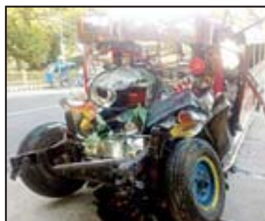
This photo provided by Land Transportation Franchise and Regulatory Board (LTFRB) shows the wreckage of a passenger van in La Union province, Philippines following an early morning collision with a passenger bus on Dec 25. (AP)

Justice Secretary Vitaliano Aguirre announced the inquiry as the government raised the toll from Saturday's NCCC mall fire in the southern city of Davao to one dead and 38 missing. The fire compounded the Christmas misery in the south of the mainly Catholic nation where tens of thousands were also displaced by floods and landslides from a storm that also killed more than 200 others on Friday.