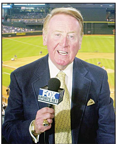
In this July 3, 2002 file photo, Los Angeles Dodgers television play-by-play announcer Vin Scully rehearses before a game between the Dodgers and the Arizona Diamondbacks, in Phoenix.

Now 88, Scully is heading into his final week behind the mic at Dodger Stadium before concluding his career on Oct. 2 in San Francisco, where the Dodgers end the regular season against the rival Giants. His 67 years with the Dodgers make Scully the longest-tenured broadcaster with a single team in profes-