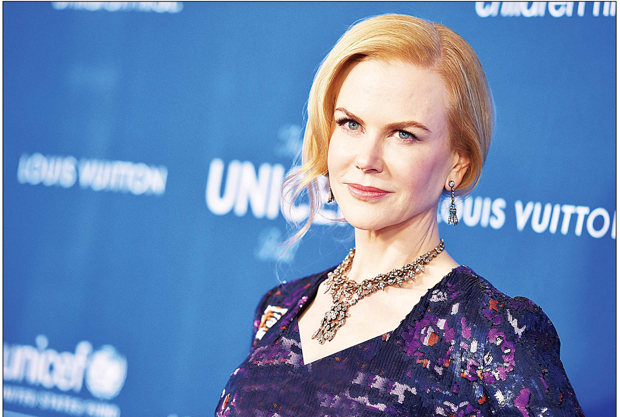
Nicole Kidman arrives at the The Sixth Biennial UNICEF Ball at the Beverly Wilshire Four Seasons Hotel on Jan 12, in Beverly Hills, Calif.